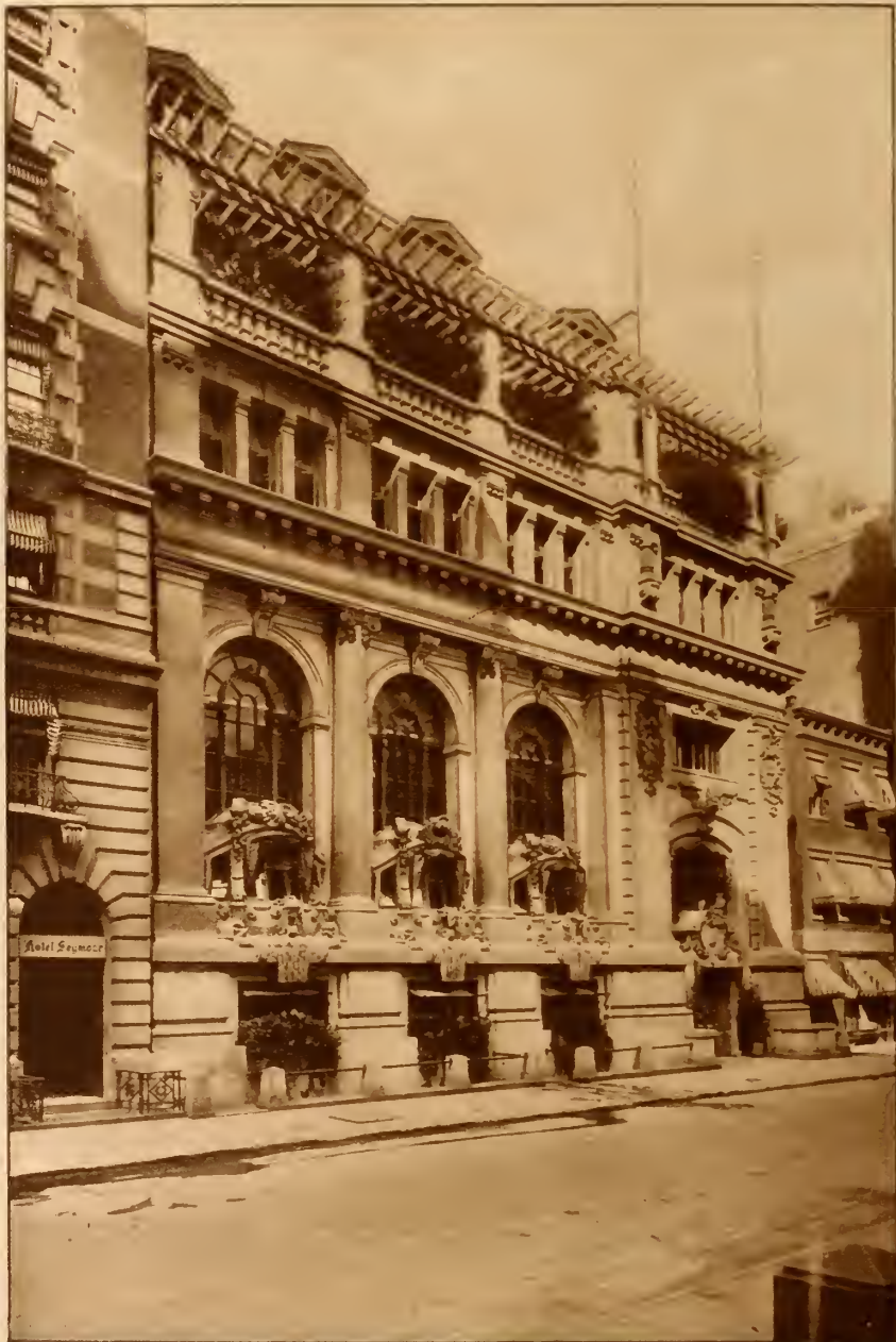
THE NEW YORK YACHT CLUB, the city home of this famous club on 44th Street. This club sponsors the International Yacht races and has held the cup since.